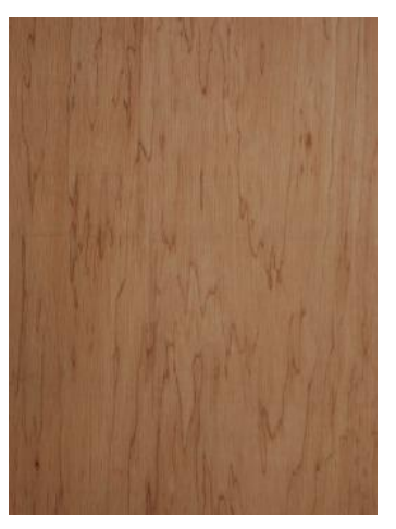
Fig 9. Tropical plywood

Plywood is a manufactured wood made from sheets of wood veneer. Sometimes referred to as a "throwaway product", plywood is versatile and can be used in walls, floors, sheds and roofing.