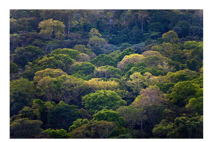
Fig 3. Congo Basin forests – home to the tree that produces Iroko

Millettia laurentii, the tree that produces Wenge timber, is listed as endangered on the IUCN Red List. It is found in the swampy forests in Cameroon, Congo, The Democratic Republic of the Congo (DRC), Equatorial Guinea and Gabon, all in the Congo Basin<sup>19</sup>. It is a medium-sized tree which produces an abundance of rose-pink flowers during its flowering season<sup>20</sup>.