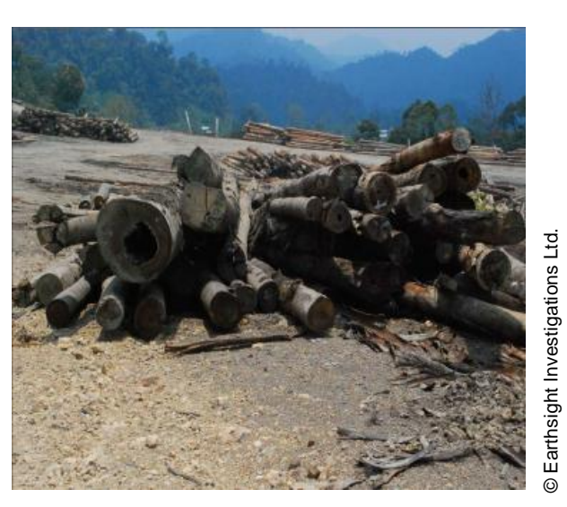
Fig 11. Samling's "log pond" at Camp C in T/0411. Undersized logs can be seen (2009)

Samling continue to supply Jewson with products, though in smaller quantities than in the past. However, on further investigation direct with Jewson, it was established that the claim of continued sales to Jewson was false. Presumably, the claim was made to impress the investigators because they were posing as potential buyers.