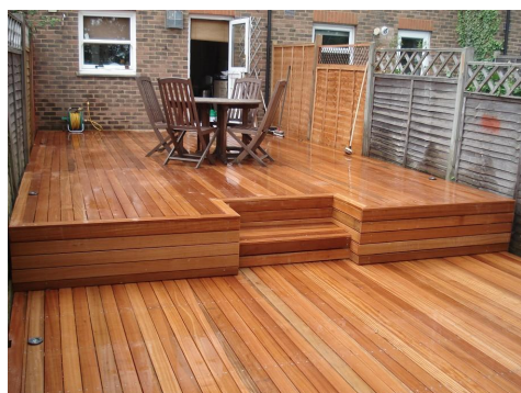
Fig 8: Bangkirai decking on sale in the UK