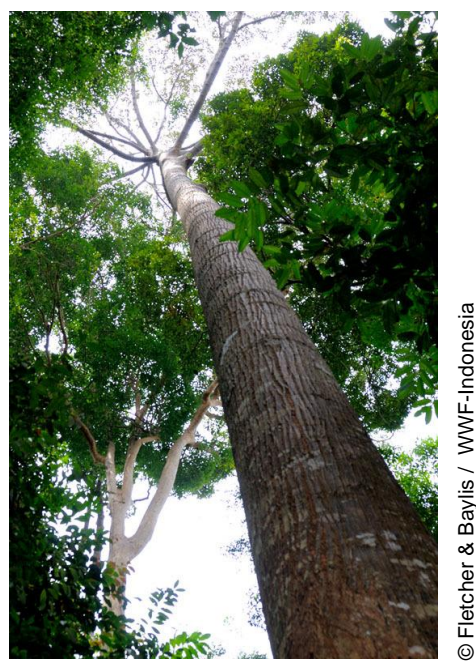
Fig 1. Shorea tree from Borneo – a source of Red Meranti

to be only a quarter of the amount required by manufacturing industries and sawmills in Indonesia. This resulting gap between the supply and demand for red Meranti stimulates illegal logging in Indonesia.