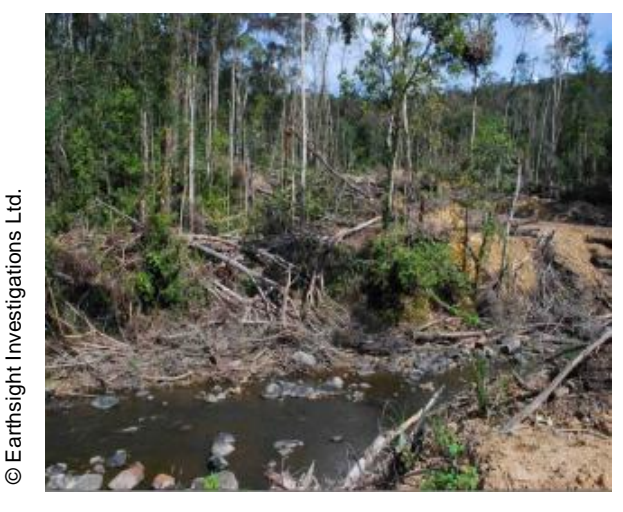
Fig 10. Logging debris and cutting along the Kelapang River in Samling's Merawa Sdn. Bhd concession (2009)

Working back from Malaysia, the study investigated plywood being supplied by the Malaysian logging conglomerate Samling Global.