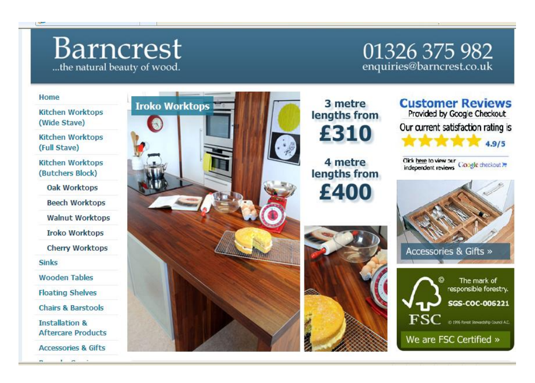
Fig 6. Iroko worktops on sale direct from the Barncrest website – note the use of FSC logo in close proximity to this non-certified product<sup>25</sup>

...We understand the temptation for our customers of buying wood at the cheapest price possible on the internet. But we ask you to consider both the eniromental [sic] impact of your descision [sic] and the reduced quality of the product you will end up with."<sup>24</sup>