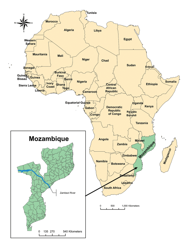
Figure 1 Map of Africa.

most countries are extremely poor and already have high inequality (Evans 2001; Wobst 2003). This study investigates the effects of agricultural trade on inequality in rural regions of Mozambique, a country that aims to alleviate poverty by promoting agricultural exports (Figure 1).1