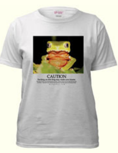
Sucking on this frog may make you insane