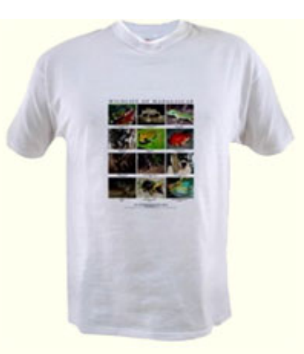
Madagascar Wildlife Save Madagascar