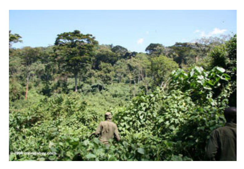
Juvenile gorilla in Bwindi (top) and a wildlife guide searching for gorillas in Bwindi (bottom).

While there have long been conflicts between local people and conservationists, some scientists point to Rwanda and Uganda as examples of conservation efforts that bring benefits to the local economy. At Bwindi well-trained guides lead small and carefully supervised groups of tourists who pay more than $300 each for a permit to see the gorillas.