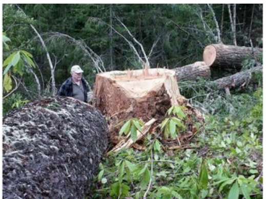
This logging on Oregon public land was found illegal by court ruling after trees were cut.

Illegal logging contributes to deforestation, biodiversity loss and greenhouse gas emissions, deprives nations of public revenue, and can lead to social conflict and human rights violations, the new Alliance said in a statement today.