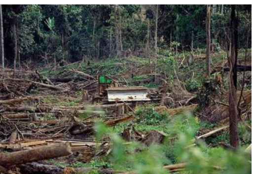
Illegal logging on Penan traditional land in Sarawak, Malaysia