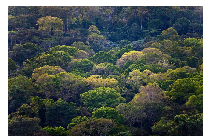
Fig 3. Congo Basin forests – home to the tree that produces Iroko

Millettia laurentii, the tree that produces Wenge timber, is listed as endangered on the IUCN Red List. It is found in the swampy forests in Cameroon, Congo, The Democratic Republic of the Congo (DRC), Equatorial Guinea and Gabon, all in the Congo Basin<sup>19</sup>. It is a medium-sized tree which produces an abundance of rose-pink flowers during its flowering season<sup>20</sup>.