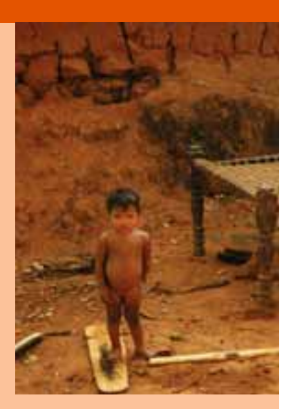
Child from the forest tribe of Kurebahal Village. Orissa. India

Sources: FAO, 2007B, 2002B. Facts and figures are online at (www.fao.org/forestry/site/28821/en) (11/20/06).