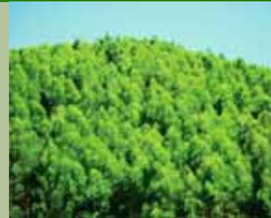
Renewable eucalyptus plantations grown in Brazil for the leading global producer of bleached eucalyptus pulp